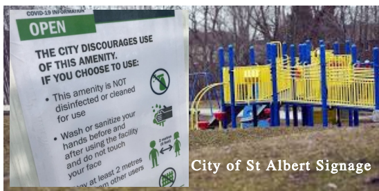
City of St Albert Signage

If you plan to take additional days off, you need to let families know in writing, at least two weeks in advance, of your planned absence. This allows back up care to be arranged.