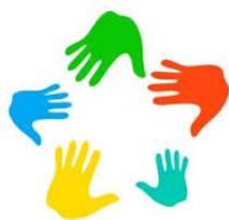
Parent Advisory Committee